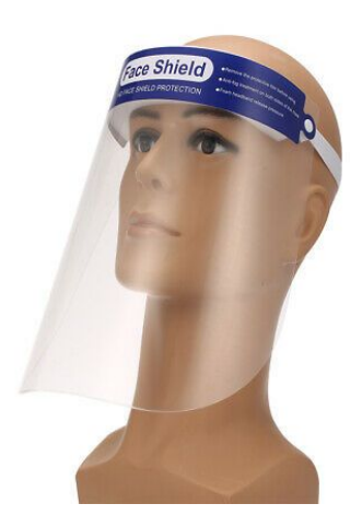
BUY THE CLEARMASK™